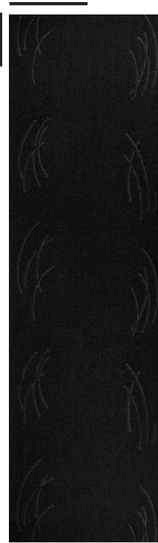
34.5" x 118.5" SHOWN