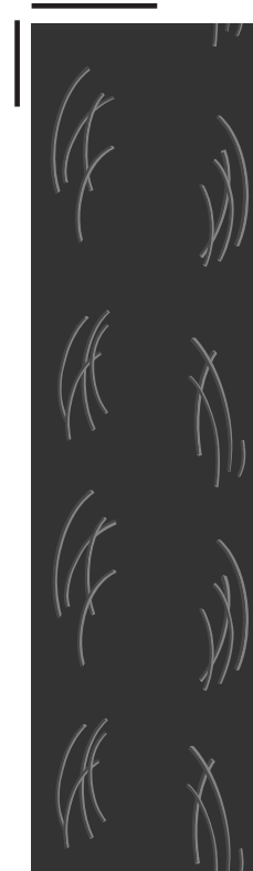
18" x 30" SECTION