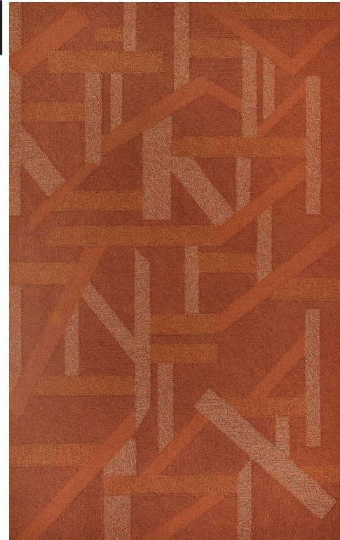
6' x 9' SHOWN