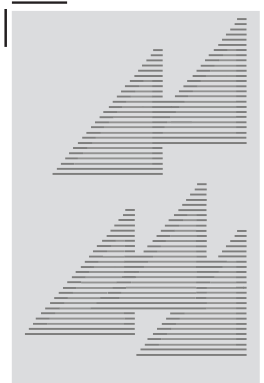
11" x 16" SECTION