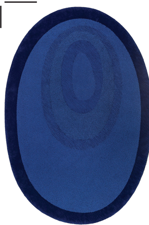
6' x 9' SHOWN