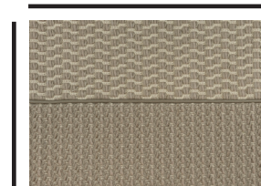
11" x 16" SECTION