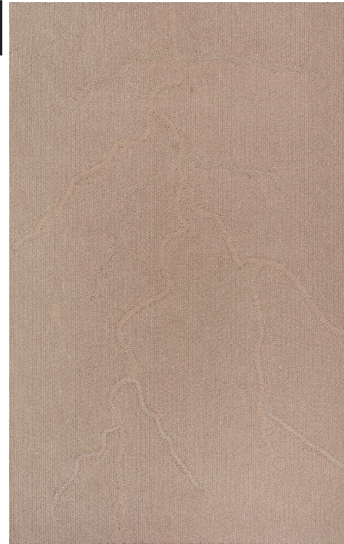
6' x 9' SHOWN