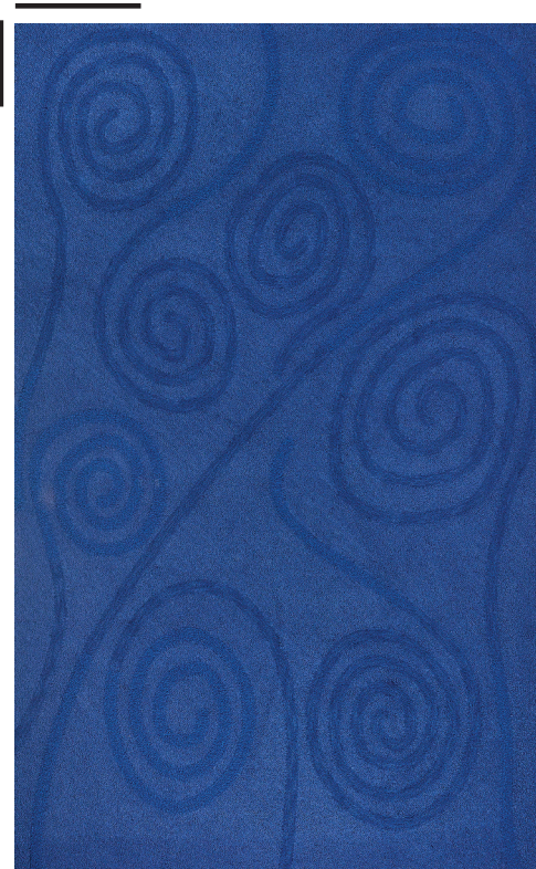
6' x 9' SHOWN