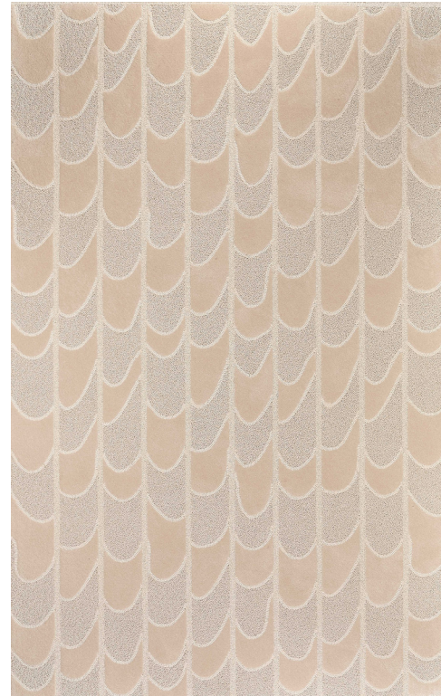
6' x 9' SHOWN