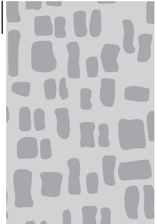
11" x 16" SECTION ROTATED