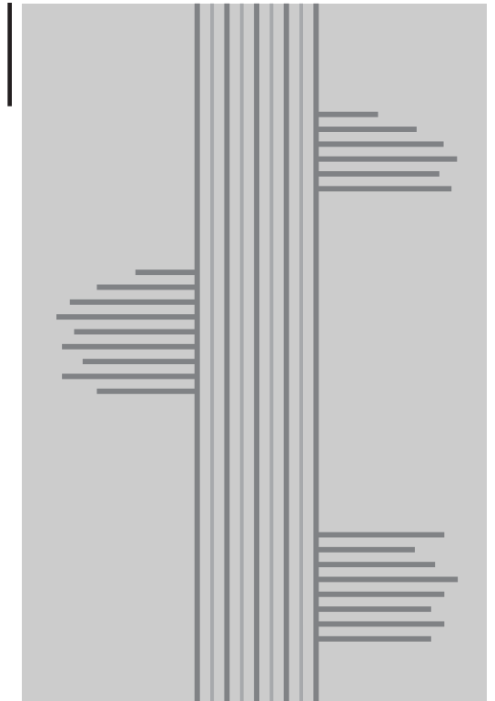
11" x 16" SECTION ROTATED