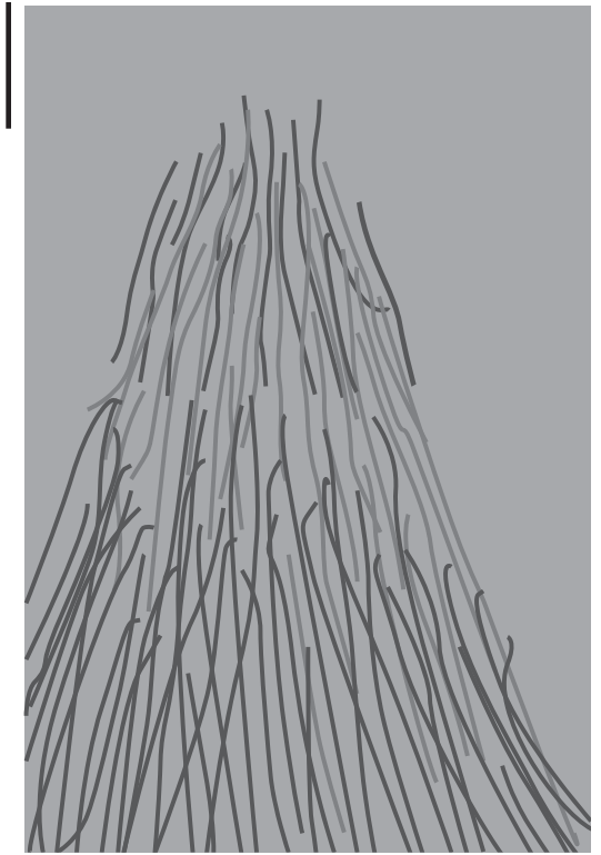
11" x 16" SECTION ROTATED