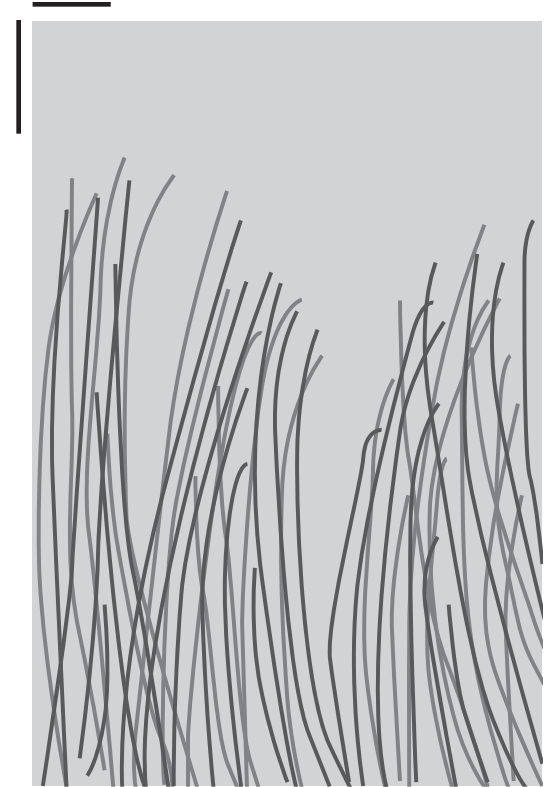
11" x 16" SECTION ROTATED