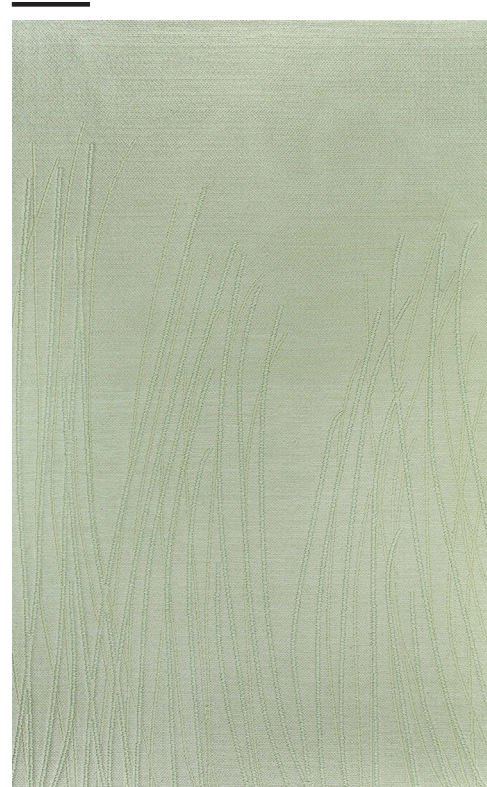
6' x 9' SHOWN