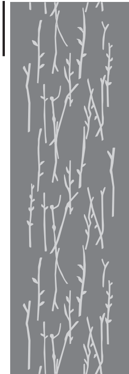
18" x 30" SECTION