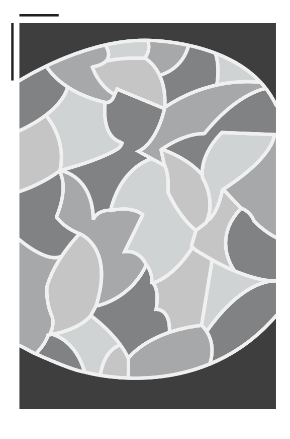
11" x 16" SECTION ROTATED