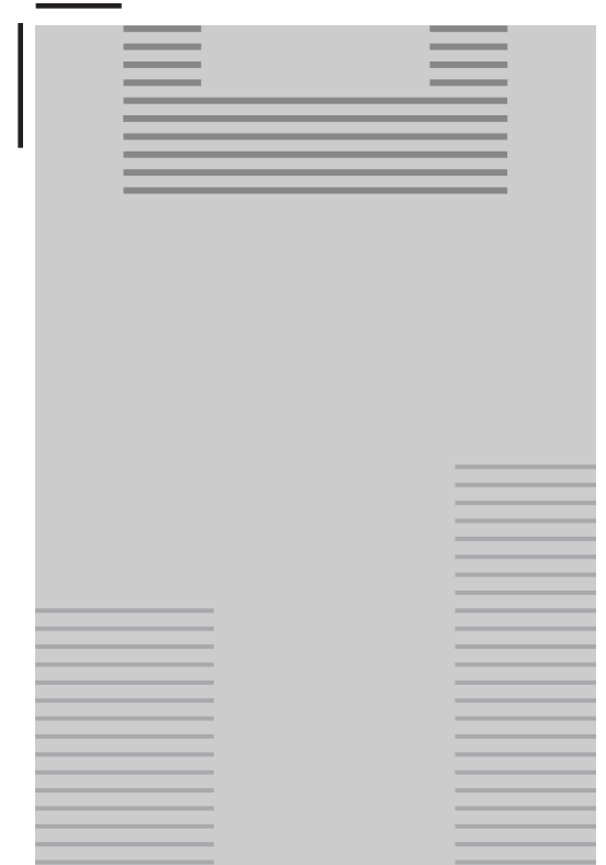
11" x 16" SECTION ROTATED