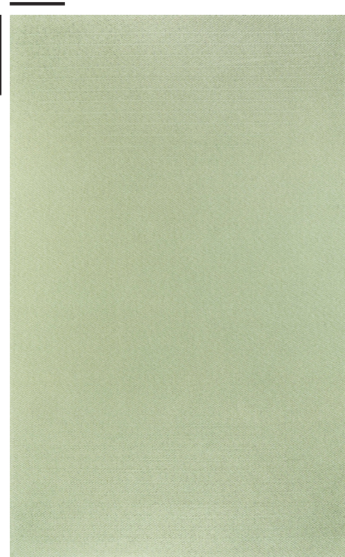
6' x 9' SHOWN