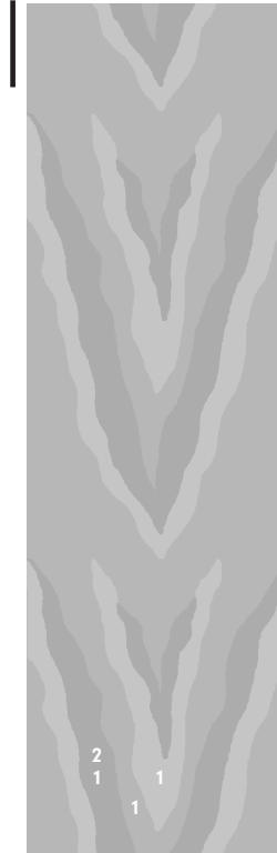
30" x 18" SECTION