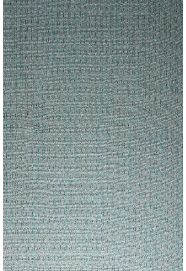
6' X 9' SHOWN Max width 11'6"