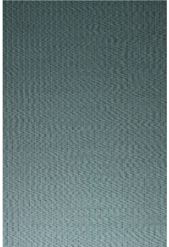
6' X 9' SHOWN Max width 11'6"