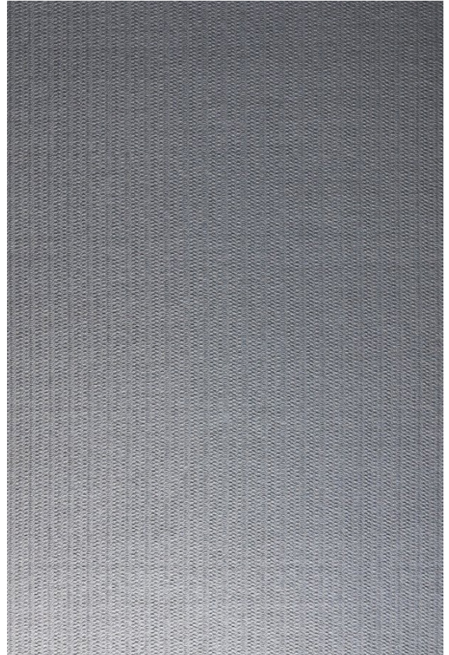
6' X 9' SHOWN Max width 11'6"