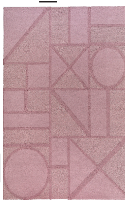
6' x 9' SHOWN