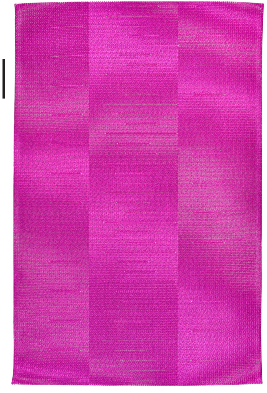
6' x 9' SHOWN