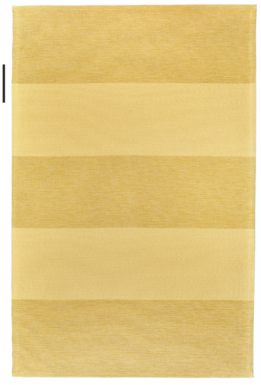
6' x 9' SHOWN