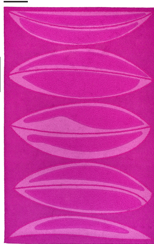
6' x 9' SHOWN