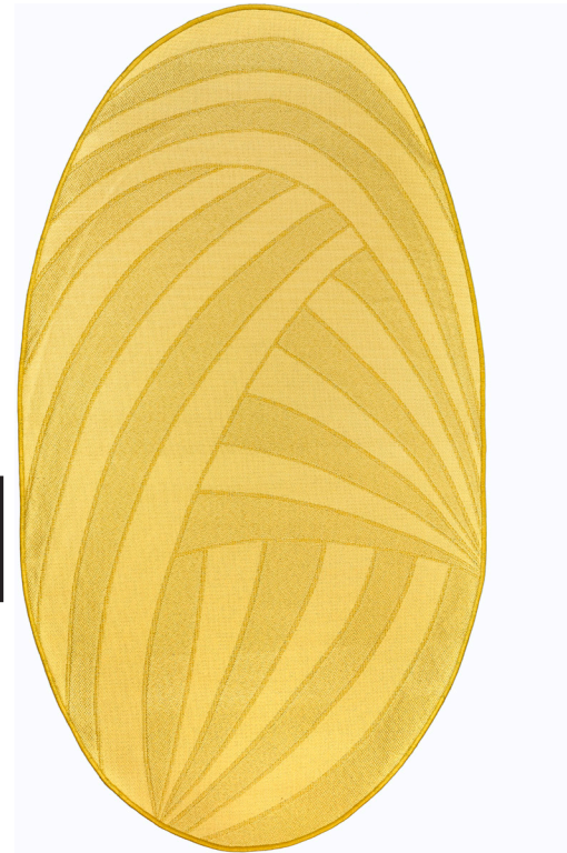
6' x 9' SHOWN

AURELIAN Twisted Wool & Alpaca Merino Wool