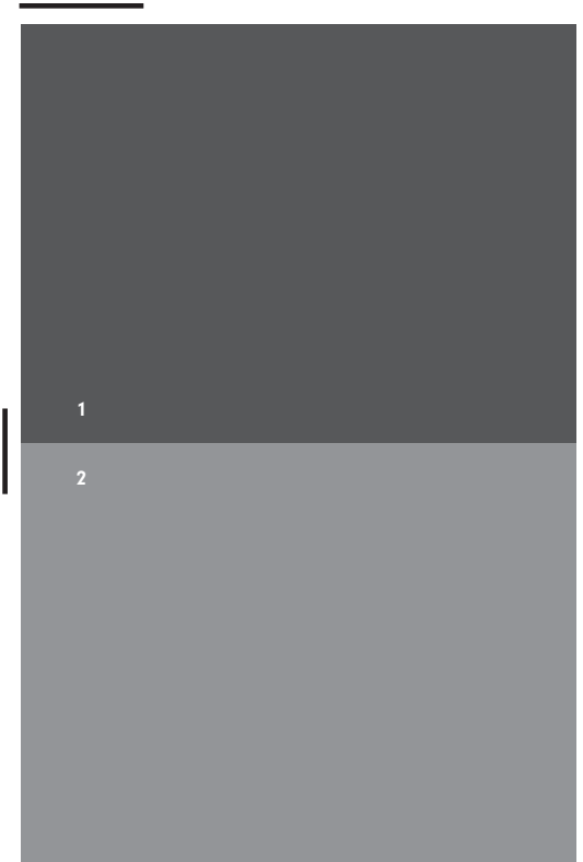
11" x 16" SECTION