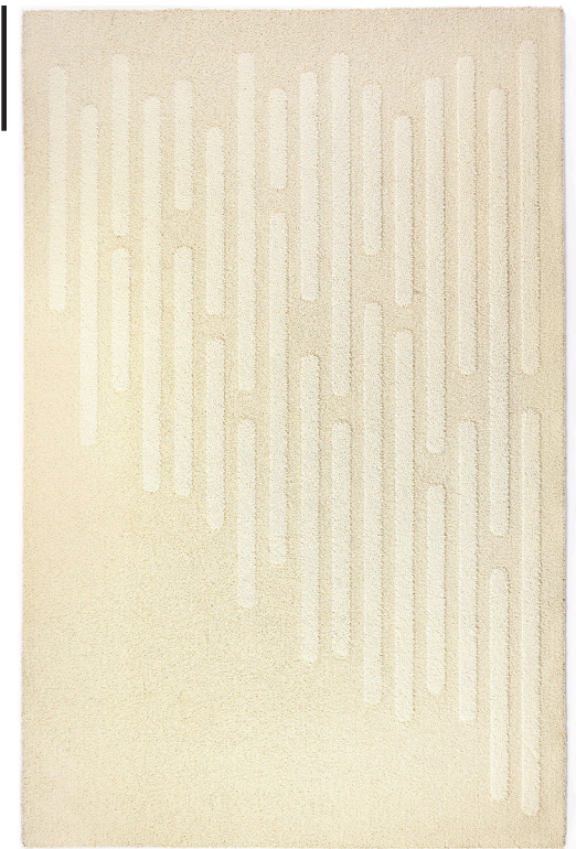
11" x 16" SECTION ROTATED