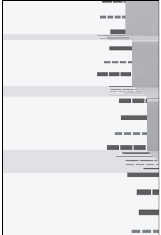
MODEL STAIRCASE SHOWN